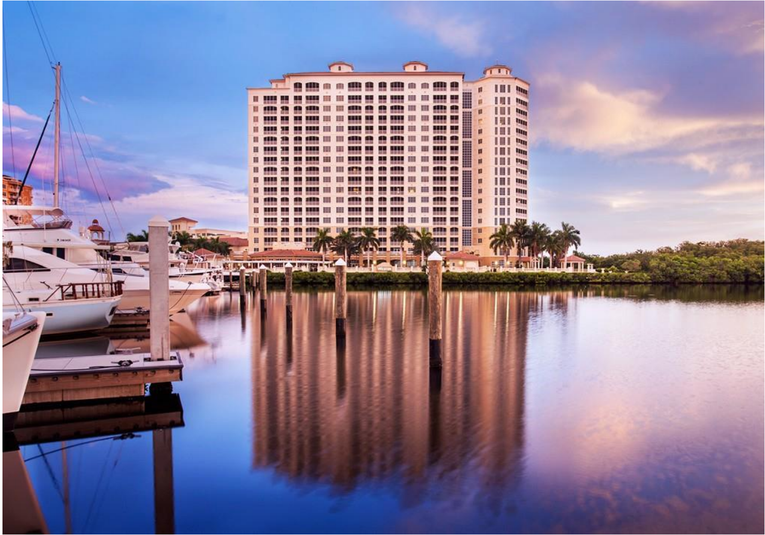
Exterior view of The Westin Cape Coral Resort at Marina Village